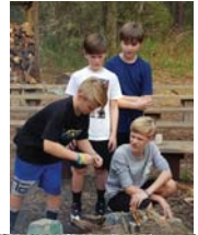
6th Grade Lake Swan Trip

Help us create awareness for Down Syndrome by wearing your silliest, craziest, funniest socks! Be sure to wear Blue and Yellow (Down Syndrome colors) to participate in the NUT Day.